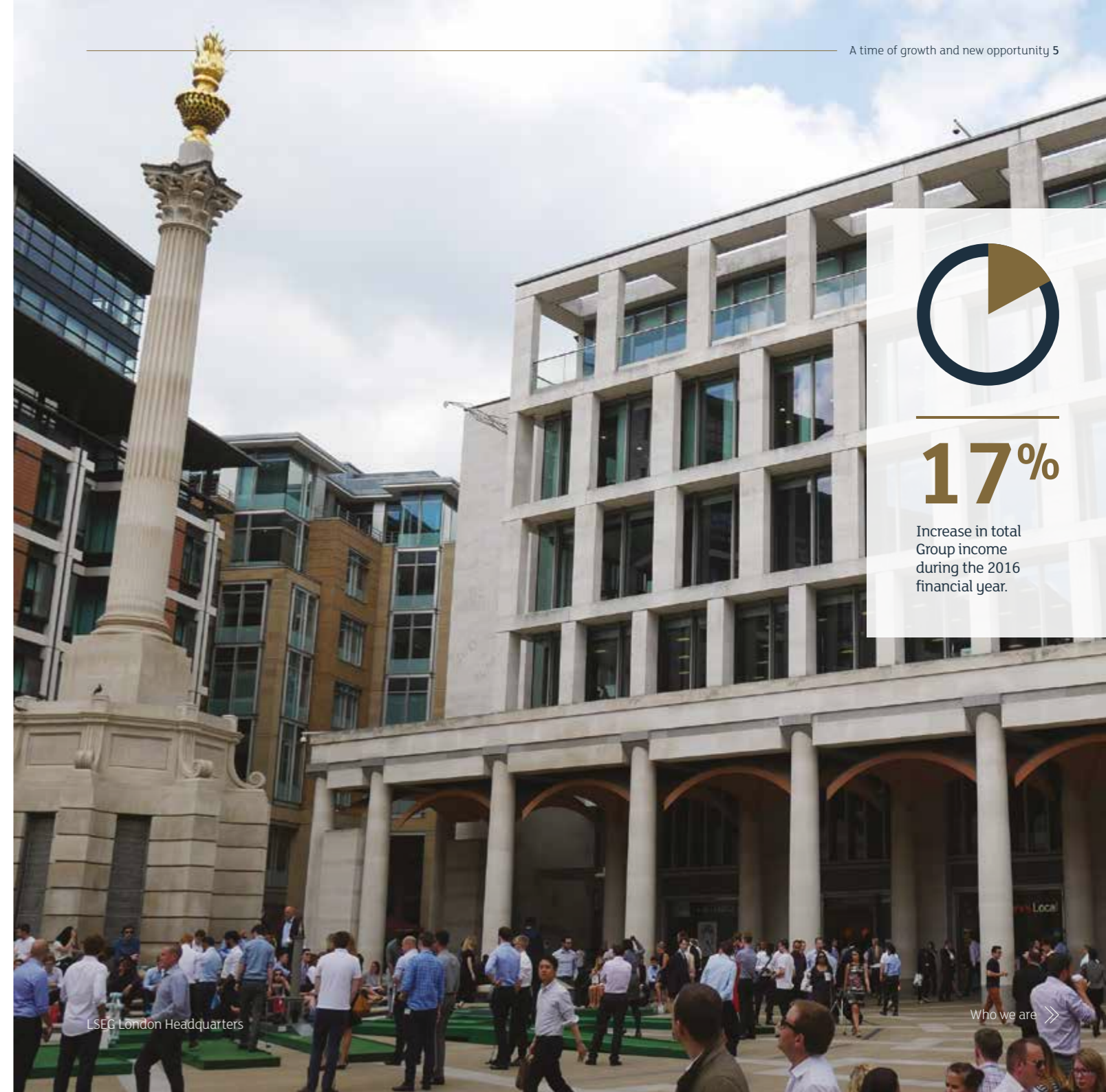
LSEG London Headquarters

Increase in total Group income during the 2016 financial year.