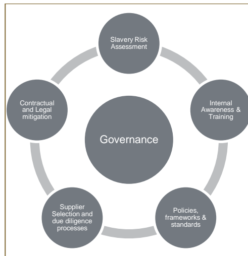
Figure 1 LSEG's approach to managing modern slavery risk

and can tackle, slavery related risks. It has determined the approach to risk assessing our supplier base for slavery risk.